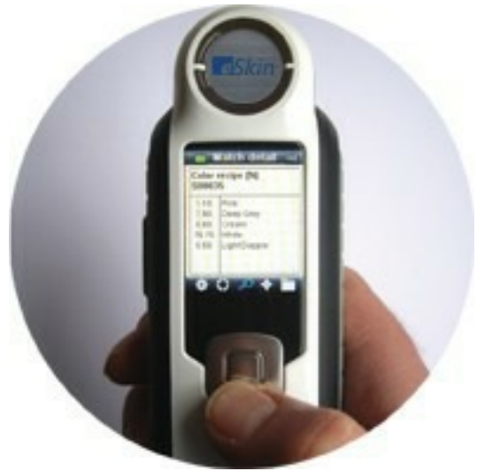
Step 2: Select Recipe