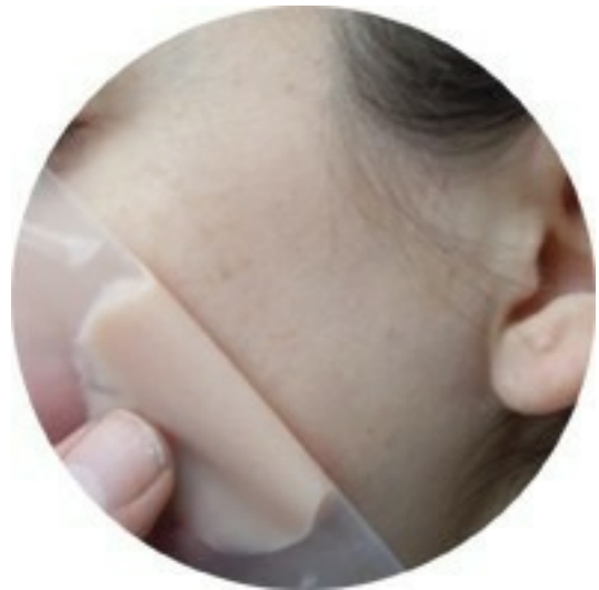
Step 4: Check Colour