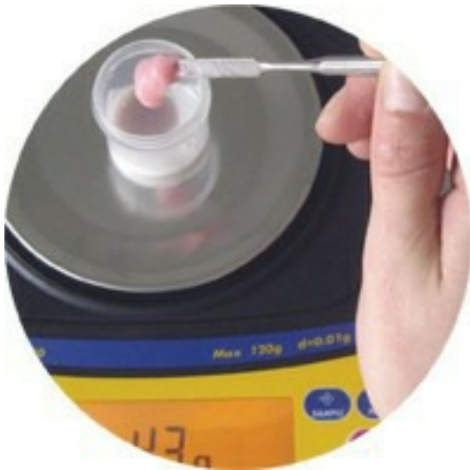
Step 3: Weigh Out