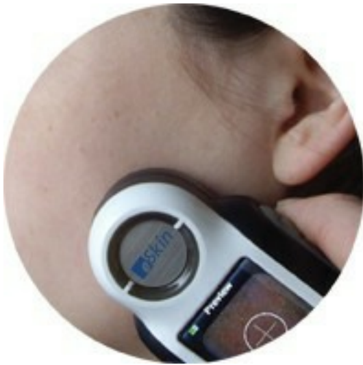
Step 1: Measure Skin

E-Skin is a "single measure and mix" system. The simplicity of the spectroradiometer and ease of use with minimal training make e-Skin the most cost effective digital skin matching solution for today's clinicians.